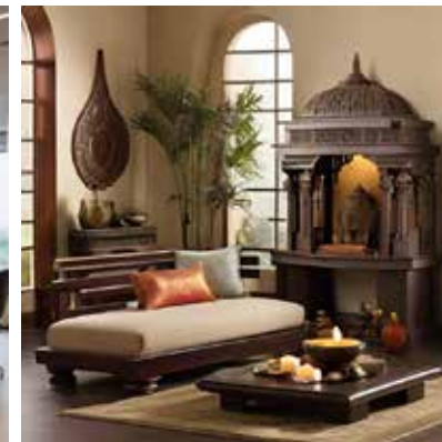
Temple Design Create serene sanctuaries with crafted temple designs.