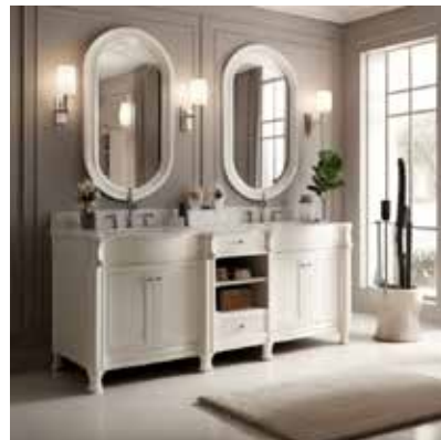
Vanity Design Manufacturers Elegant makeup stations with storage, mirrors, and lighting.