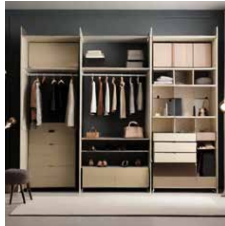
Walking Closet Manufacturers Ample space for organizing clothing, shoes, and accessories, with customizable storage.

Discover an array of innovative wardrobe solutions at Attraente Kitchen, where functionality meets style seamlessly. Whether you desire the spacious luxury of walk-in closets or the sleek efficiency of sliding door wardrobes, we offer customizable options tailored to your unique storage requirements. Experience the epitome of quality craftsmanship and functional design, ensuring that your wardrobes not only organize your belongings but also elevate the aesthetic appeal of your space. Trust Attraente Kitchen and transform your storage solutions into works of art that reflect your style and enhance the functionality of your home.