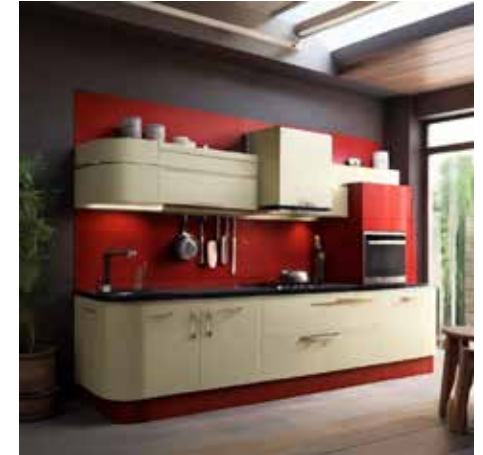
Inline Shaped Kitchen Manufacturers Compact solutions with all elements along a single wall for efficient use of space.