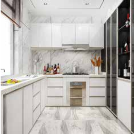
L Shaped Kitchen Manufacturers Versatile and space-efficient designs, optimizing corner spaces effectively.

Discover versatile kitchen solutions at Attraente Kitchen. From L-shaped to U-shaped designs, our kitchens optimize space and enhance efficiency. Experience top-tier materials and innovative craftsmanship for kitchens that stand the test of time. Choose from sleek Italian designs or precise German engineering. Elevate your culinary space with Attraente Kitchen.