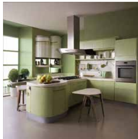
Italian Shaped Kitchen Manufacturers Sleek and modern designs, combining functionality with sophisticated aesthetics.