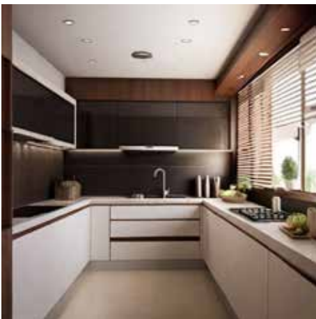
Parallel Kitchen Interior Design Efficient workflow with two parallel countertops, suitable for small and large kitchens.