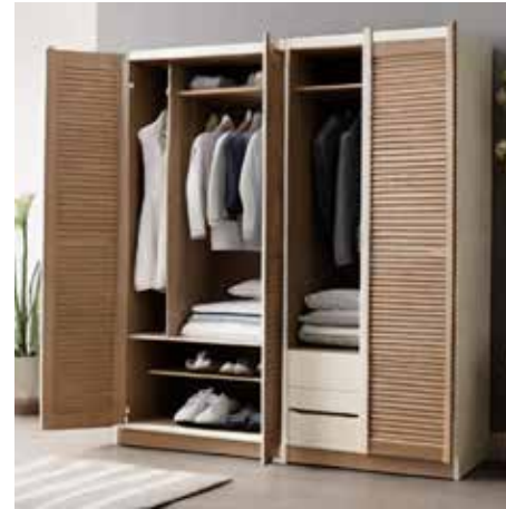
Openable Shutter Manufacturers Traditional door designs for easy access to clothing and storage compartments.