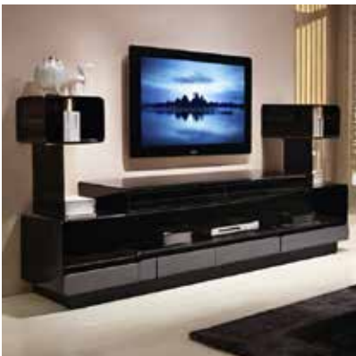
LCD Panel Design Manufacturers Stylish integration of television screens into furniture for entertainment units.

From sleek LCD panel integrations to elegant vanity setups, our designs blend functionality with sophistication. Elevate your workspace with ergonomic office solutions, while creating serene sanctuaries with our temple designs. Organize your footwear effortlessly with our stylish shoe rack designs, balancing practicality with aesthetics.