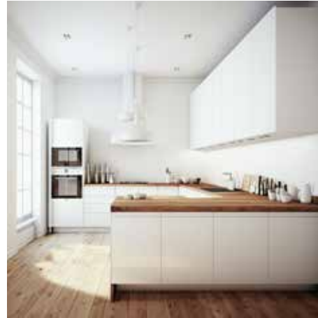
G Shaped Kitchen Manufacturers Enhanced functionality and aesthetics with additional workspace and storage.