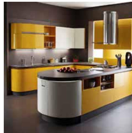
German Shaped Kitchen Manufacturers Precision engineering and ergonomic design for maximum efficiency and comfort.