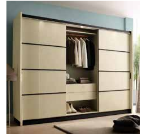
Sliding Doors Manufacturers Space-saving wardrobes with sliding doors, ideal for modern interiors or limited space.