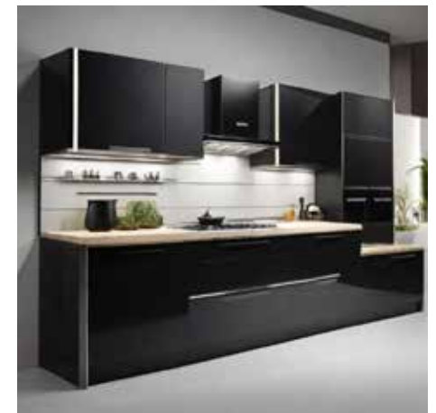
Hettich Modular Kitchen Incorporating high-quality Hettich fittings for smooth operation and durability.