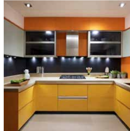
U Shaped Kitchen Manufacturers Maximized storage and workflow efficiency for larger kitchen spaces.